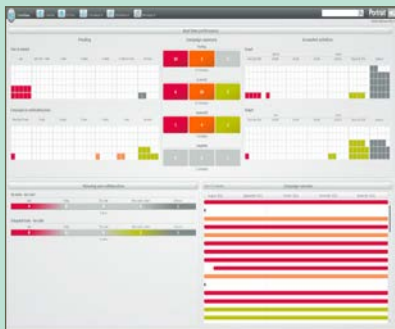
Monitor campaign performance in real-time using intuitive interface designed for marketers.

Craft and orchestrate your customer lifecycle best practice process via an intuitive marketer-oriented interface.