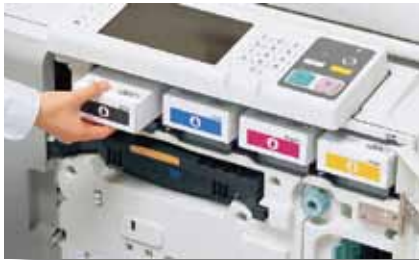
Commercial grade inking system – Includes an easily recyclable cardboard box and disposable plastic sleeve

These printers use specially formulated ink, designed for printing at high rates of speed. Unlike water-based inks, the systems use oil-based pigment ink that shows solid application and no paper distortion. The CMYK cartridges are the only consumables you'll need.