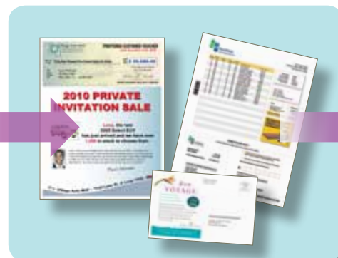
Output to inserting system

High-speed affordable color and monochrome output