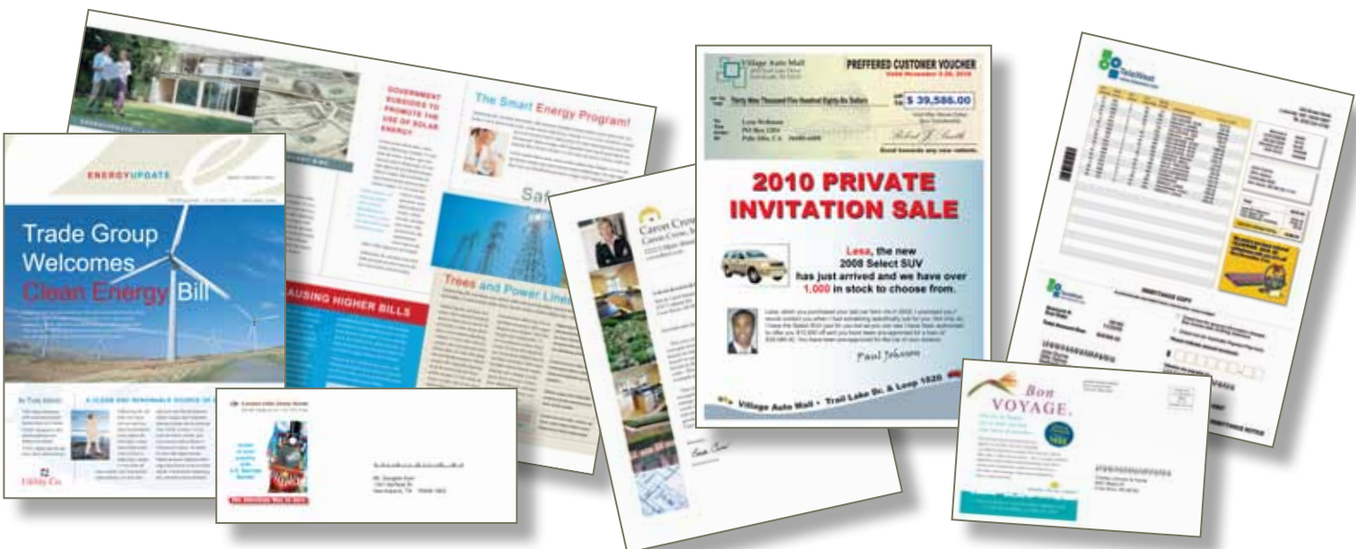
Sample transactional, transpromotional, envelope, newsletter and postcard documents.